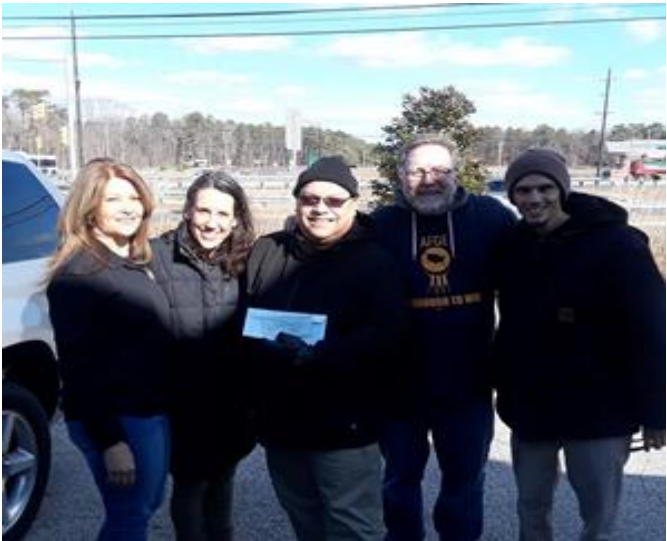
AFGE 200, NFFE 1340, NATCA Presenting Donations to Jersey Cape Military Spouses Club